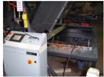
VTech 75 at work at CSI

The Gilmer, TX coil manufacturer Coil Specialist, has recently gotten “out of the water” and into a VTech 75 Leak Detection System featuring pressure decay and a Hydrogen Tracer Gas sniffer leak locator. The equipment is supplied with a barcode reader and is interfaced with a personal computer running VTech’s data logging software. This enables tracking the serial numbers of the coils for inventory and quality purposes.