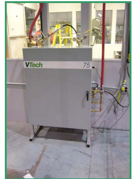
VTech 75 Split System