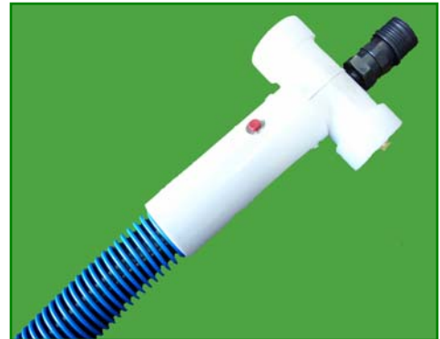
VTech's light and compact Refrigerant filling head

switching to R410a will need to replace their existing charging equipment. VTech makes that easy with a high pressure filling head capable of charging all other common HFC refrigerants. Also, the machine has all of the refrigerant temperature and pressure data stored in its program logic. You've done all the design work necessary for the switch, so there's no need to worry about anything else. Basically, that means we're ready when you're ready. Contact us today for more details.