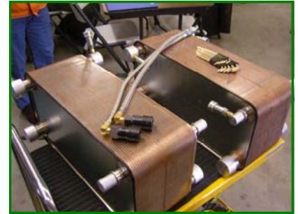
Large Heat Exchangers to be tested

Our Technical who supervised the installation, says "Compared to inside-out helium leak testing, also known as vacuum chamber