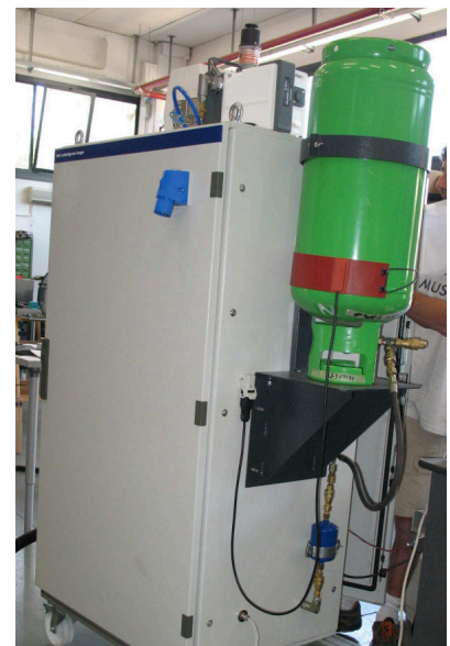
Heated Refrigerant Supply with Tank Support