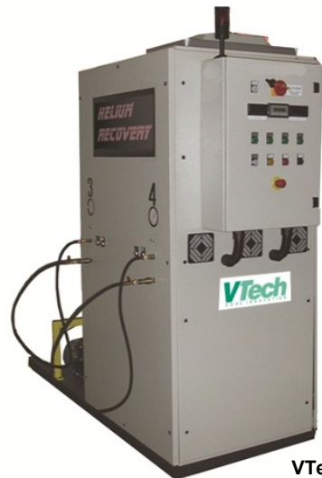
VTech 300H Helium Recovery System

For example, you want to recover to 500 mbar and reconcentrate to 14 bar (ABS) and have a maximum flow of 1,800 nli/h. The size of the recovery tanks and compressors are sized according to the project requirements and will recover about 90-95% of the helium to be reused. Click on the proceeding link for more information on the VTech 300H Series of Helium Recovery Systems.