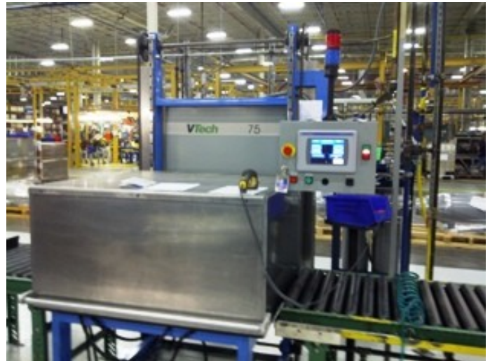
VTech 75 with integrated hood

The compressors themselves pose an interesting testing challenge, however, as they must be checked both for external leaks but internal leaks from one side of the compressor to the other, and at very high pressures, over 700 psig. Perhaps as important is the sequence of successive barcode scans that include the model, serial number and employee badge number for quality tracking and accountability purposes.