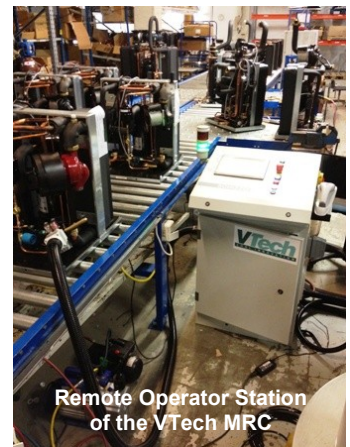
Remote Operator Station of the VTech MRC